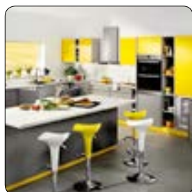
Zanussi Quadro Range (Europe, Middle East and Africa)

2012 was a year with extensive product launches across all markets. Below is a selection of the products launched.