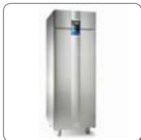
Electrolux Professional Ecostore Refrigerators (Global)

Electrolux Precision Brushroll Clean is a lightweight vacuum cleaner with cyclonic technology. The Brushroll Clean Technology helps remove hair from the brushroll with the touch of a button.