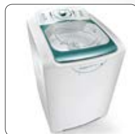
Electrolux Ecologic 12 kg top-load washing machine (Latin America)

Ultra Power is the most powerful vacuum cleaner in the Electrolux cordless range. Its unique combination of high performance and very long run time, makes it great for both quicker cleaning jobs and longer, tougher ones.