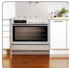
Westinghouse Vulcan Cooker (Australia)

Electrolux Professional Ecostore refrigerators are energy-efficient and robust and provide 50 liters more space than equivalent cabinets. Electrolux created Ecostore in response to customer feedback.