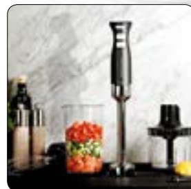
Electrolux UltraMix Pro Stick Mixer (Global)

The Vulcan cooker is made with market-leading features and statement design, including large oven capacity, twin fans, full touch controls and new generation cool door.