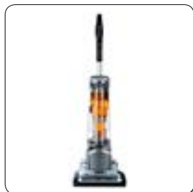
Electrolux Precision Brushroll Clean Upright Vacuum (North America)

This washing machine has a capacity of 12 kg and is the most water-efficient and economic washing machine in the market.