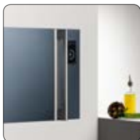
Electrolux Grand Cuisine Range (Global)

Clean lines and easy to use are the hallmarks of the new full built-in range, Zanussi Quadro, which is for users looking for flexibility and low maintenance.